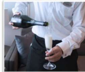
船上無限量享用指定酒水