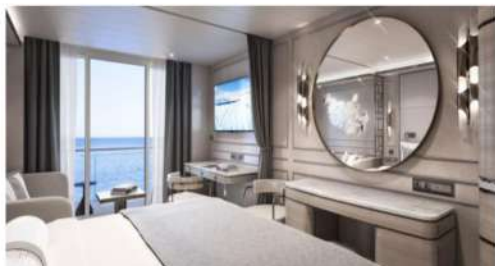
Deluxe Suite with Verandah (28.3m 2 / 304 ft 2 )