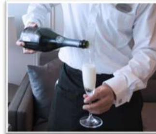
船上無限量享用指定酒水