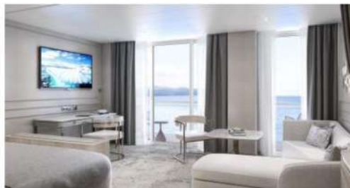
Penthouse Suite with Verandah (42.5 m 2 / 457 ft 2 )