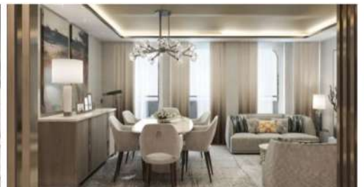
Owner's Suite with Verandah (105 m 2 / 1,130 ft 2 )